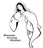
Blessed Among Women...

Tuesday: 6:30 AM, 9:00 AM, Children/ 4:00 PM, 5:30 PM ( All in English), 7:00 PM (Vietnamese).